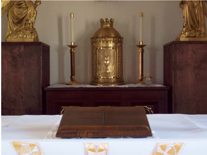
Step 6 – Place wooden book rest on the front edge of the altar facing the congregation.