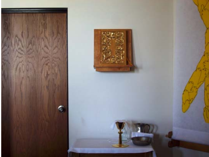
Complete Set Up for Credence Table on Mary's Side